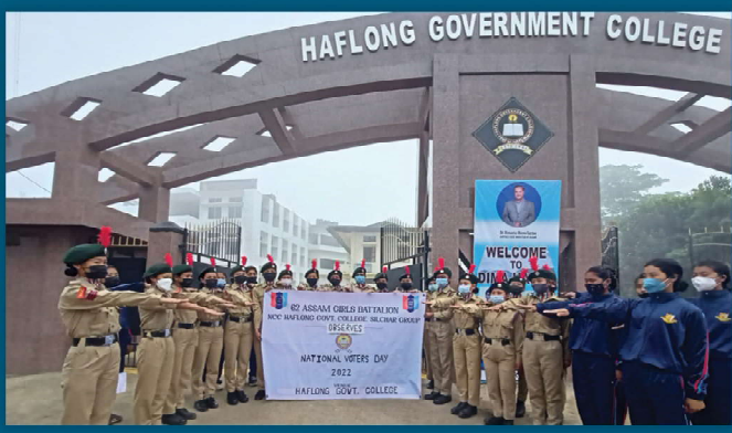
Taking Pledge on National Voters Day, 2022

Participation of Students of HGC at Yoga programme by AYUSH MISSION