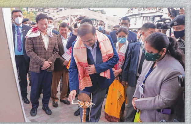
Inauguration of Arts Building of HGC by Hon'ble CM of Assam Dr. Himanta Biswa Sarma