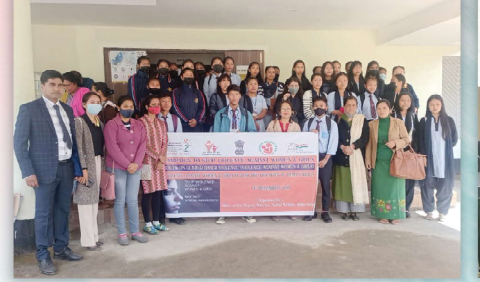
'Campaign to Stop Violence Against Women and Girls' rally Orgd. by Office of the Deputy Commissioner, Social Welfare Dept. Dima Hasao