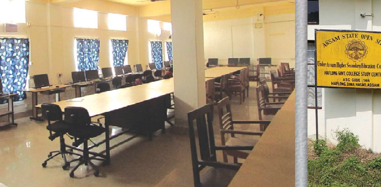
Digital Library Reading Room