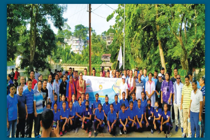
'Fit India Run' Celebration of Azadi kaa Amrit Mahotsav

Plantation Programme at HGC Girl's Hostel