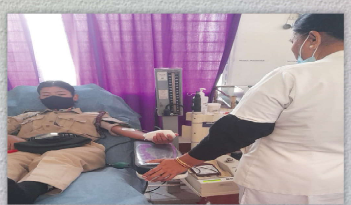
To commemorate National Youth Day our Girls cadets donated blood at Blood Bank of Haflong Civil Hospital, Haflong