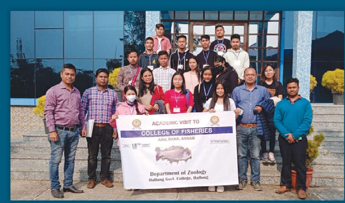
Academic Visit to College of Fisheries, AAU, RAHA, Assam, 2022, Department of Zoology

Haflong Govt. College Students Association