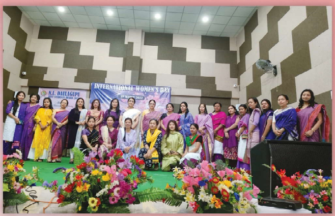
International Women's Day, 8th March, 2022