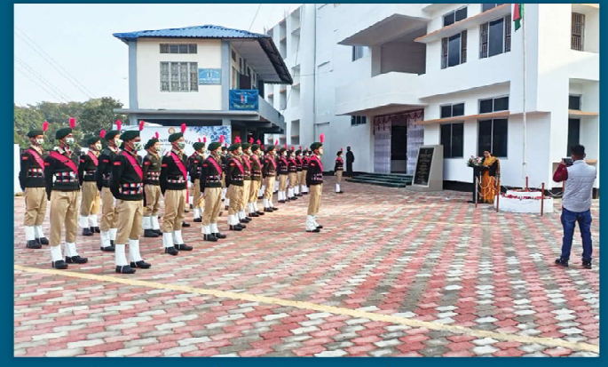
Celebration of Republic Day, 26th January 2022