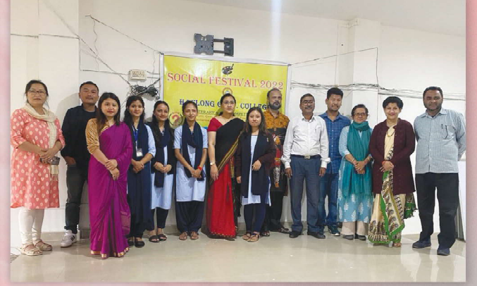
Social Festival, 2022