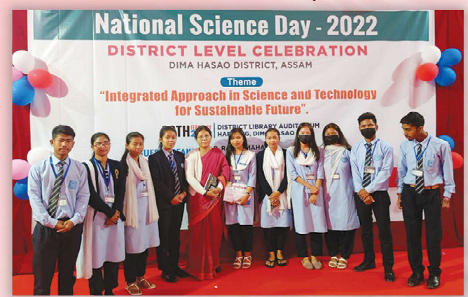
Observation of National Science Day - 2022

Celebration of World Environment Day, 5<sup>th</sup> June, 2022