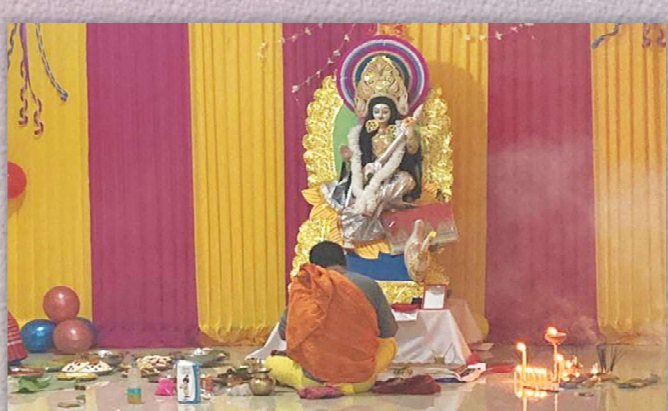
Celebration of 'Saraswati Puja'

Teaching the Children of 'Hosanna Orphan Home' by the NSS volunteers of HGC 'Relief distribution to the landslide affected people' by NSS & HGCSA