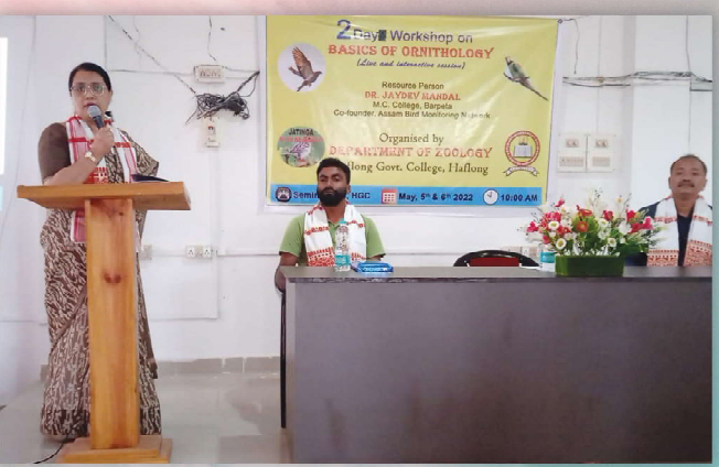
2 Day Workshop on Basics of Ornithology, 5th & 6th May, 2022