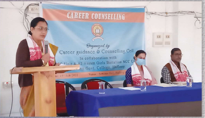
One Day Workshop on Career Counselling