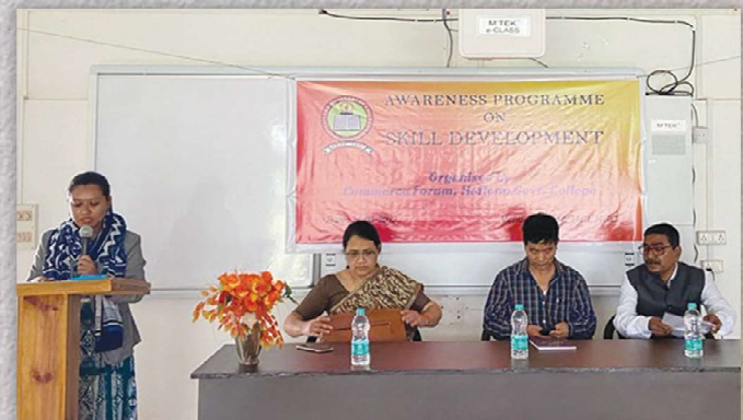
Awareness Programme on Skill Development