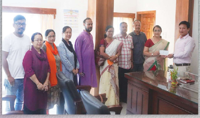
Donation for CEM's Relief Fund by HGC Fraternity